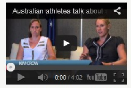
Australian athletes talk about supplements in sport