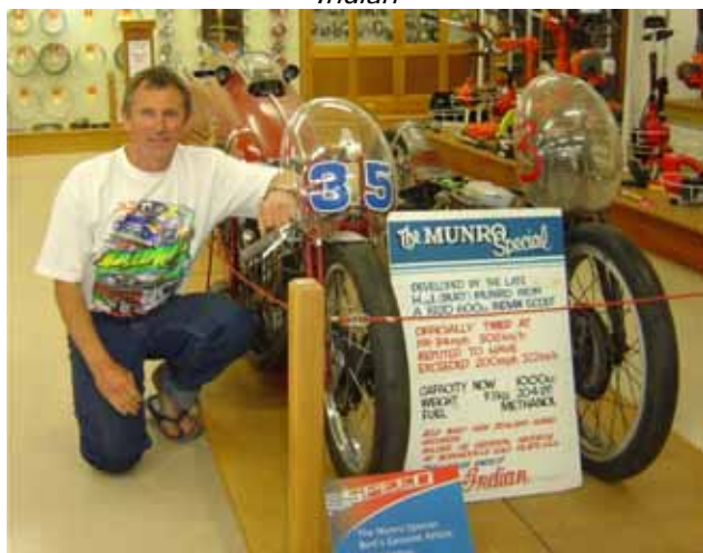
Me & bikes. (check out the T shirt)