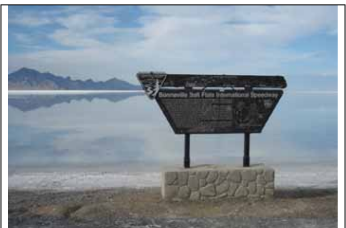
Bonneville entrance underwater 2007 (see, we are not on our own - Ed.)