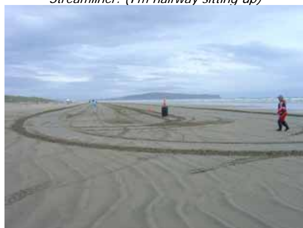
Oreti beach races (Burt's beach)