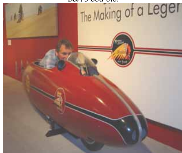
Streamliner. (I'm halfway sitting up)