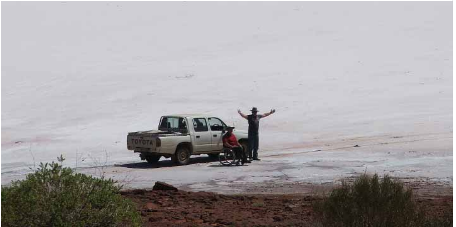
A sight to please all DLRA fans, Lake Gairdner 18/10/2009