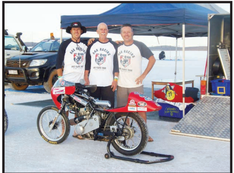
ABOVE: AAA team at Bonneville in 2015.