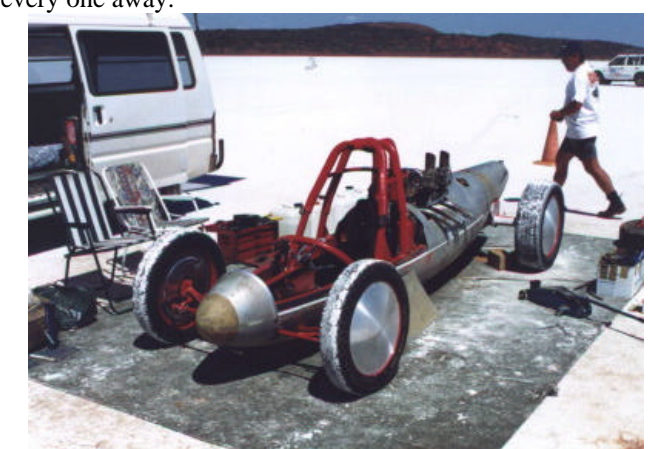
A new car at the meet this year was Kenny Rhodes old timey Willy's 4 cylinder powered belly tank