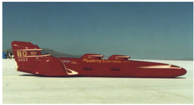
Alan Murchison's amazing twin engined streamliner blew every one away.