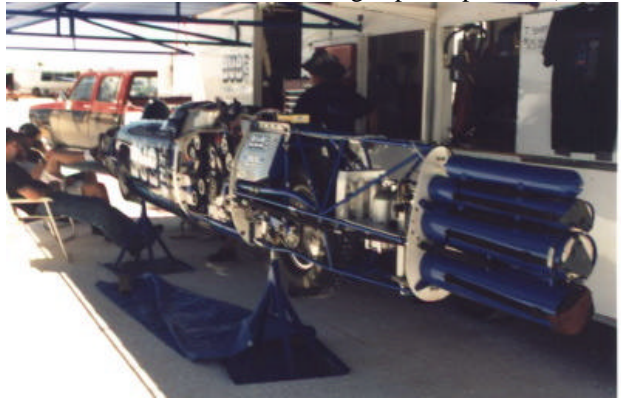
CONGRATULATIONS to Dennis Manning and Team BUB Fastest Speed of the meet - 289.715