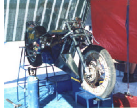
Phil Arnold's flying single cylinder was looking to make some runs that would make it the fastest single in the world