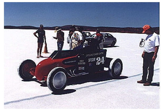
Rea Weir Mumford # 24 with it's new nose and wheel discs fitted