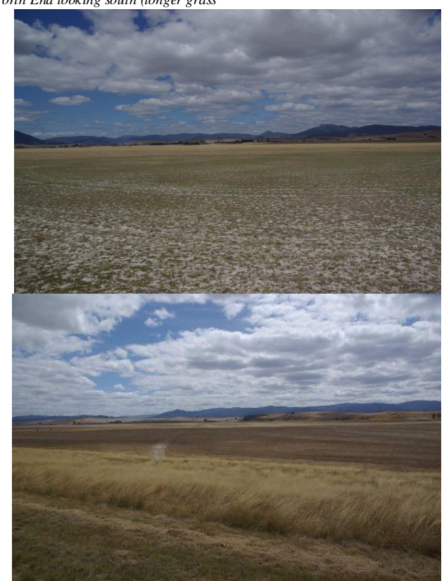
Southern end, shorter grass and sparse Edge of lake