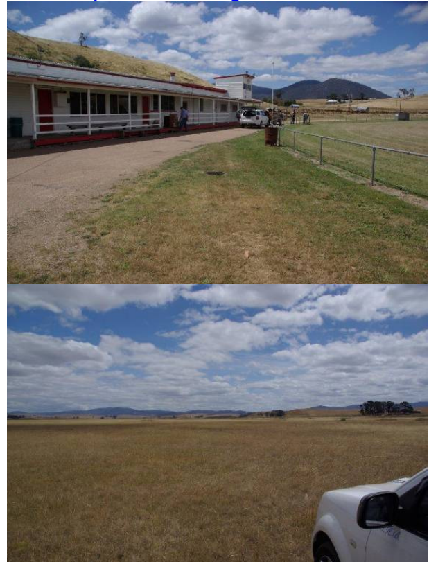
Football Club Rooms North End looking south (longer grass

Photos that Rod took from Lake Omeo that were shown at the meeting. More photos are also available on line at <u>http://www.dlra.org.au/ref-lake-omeo.htm</u>