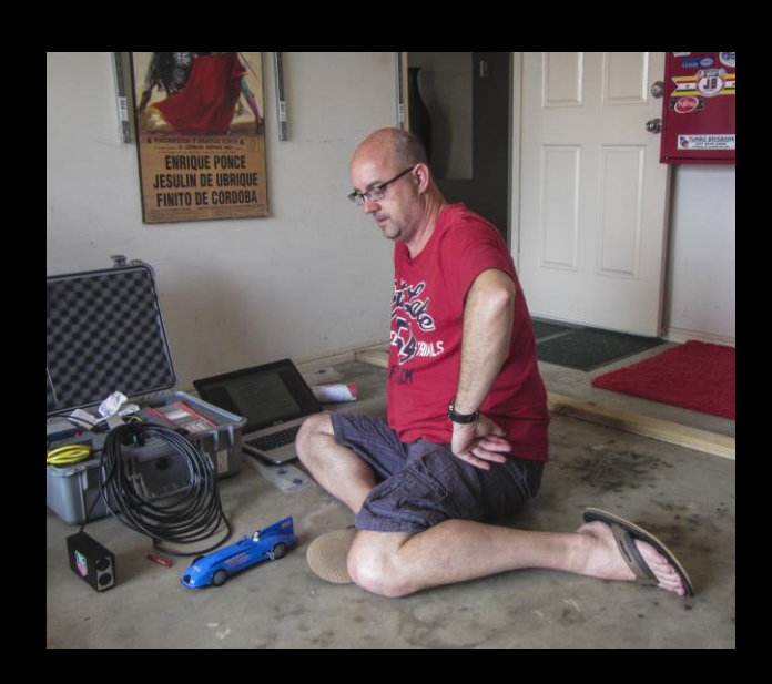
Chief Timer testing equipment with Malcom Campbell's Bluebird.